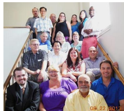
Look at that crew! That's most of this year's Department of Mathematics!!

This year, the Mathematics Homecoming Breakfast will be held on November 2, 2012, beginning at 9:00 a.m. in the Sam Rayburn Student Center. Please join us for this wonderful event. It is an amazing opportunity to meet and exchange stories with our faculty, retirees, alumni, students, and friends. We look forward to seeing you there.