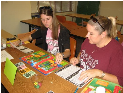
Professional Development Workshops