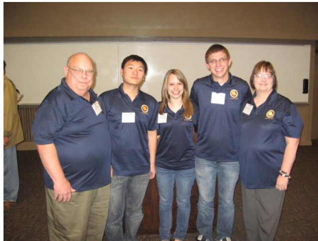
Fourth Place in the State!!