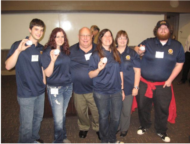
First Place in the State!!