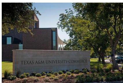
The front entrance to campus.

If you wish to make contributions to any of our scholarship funds, you may call the Department at 903.886.5157 or the A&M-Commerce Foundation at 903.886.5712