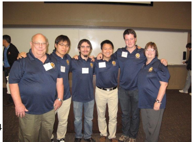
Seventh Place in the State!!