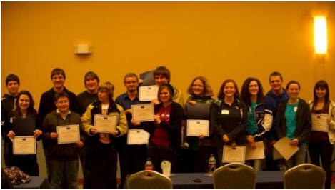
Algebra Competition winners

AIM Day (Adventures in Mathematics) in February marked